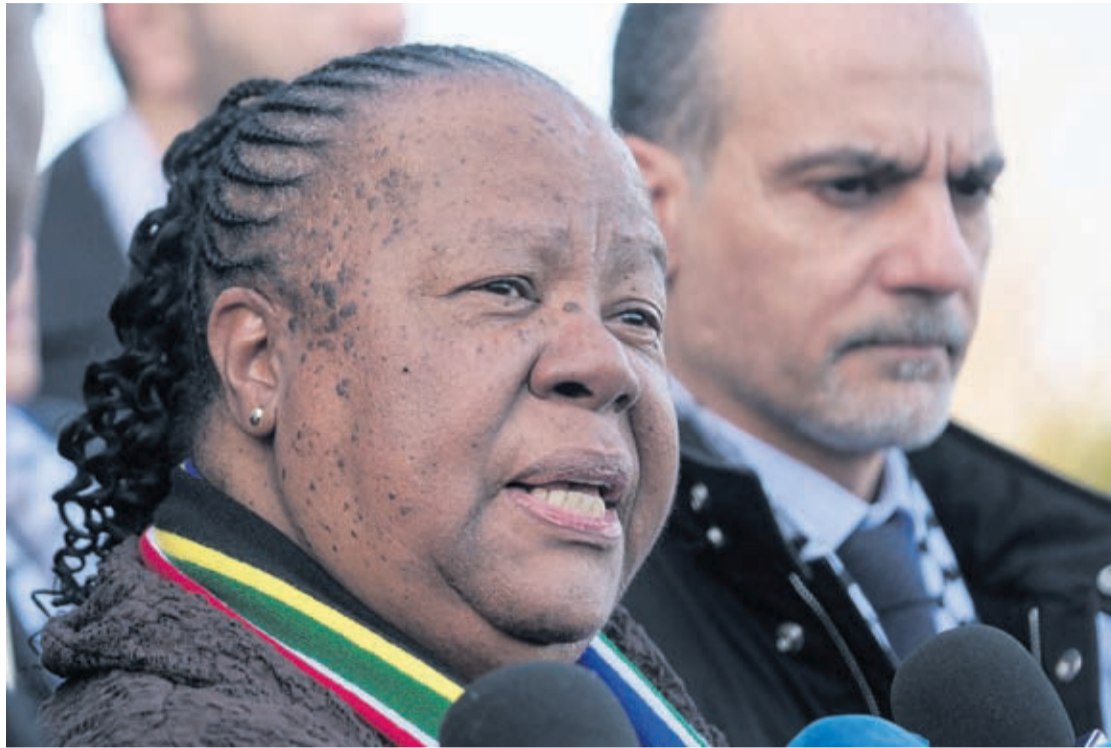
South Africa's Foreign Minister Naledi Pandor addresses reporters after session of the International Court of Justice, or World Court, in The Hague, Netherlands, Friday, Jan. 26, 2024.

"I have already issued a statement alerting those who are South African and are fighting alongside or in